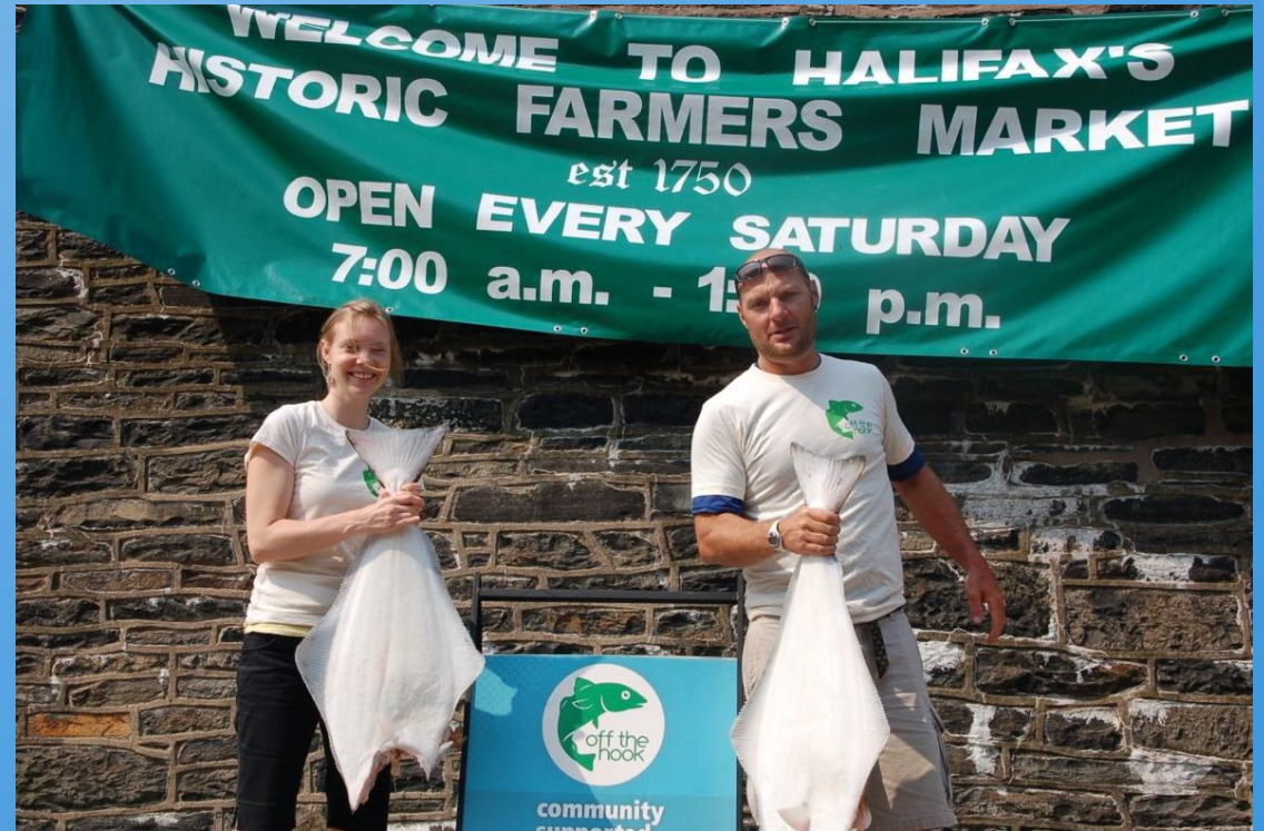
ENGO initiated project