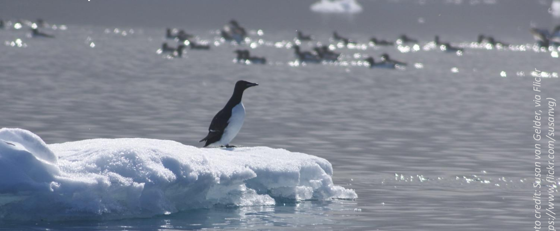
Thick-billed murre near Bylot Island, Nunavut