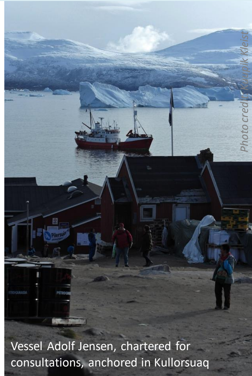
Vessel Adolf Jensen, chartered for consultations, anchored in Kullorsuaq