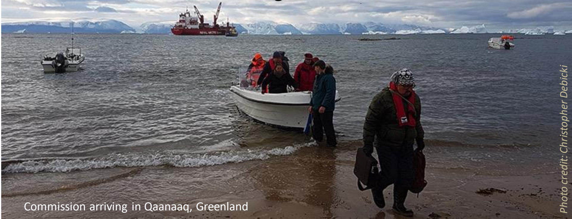
Commission arriving in Qaanaaq, Greenland