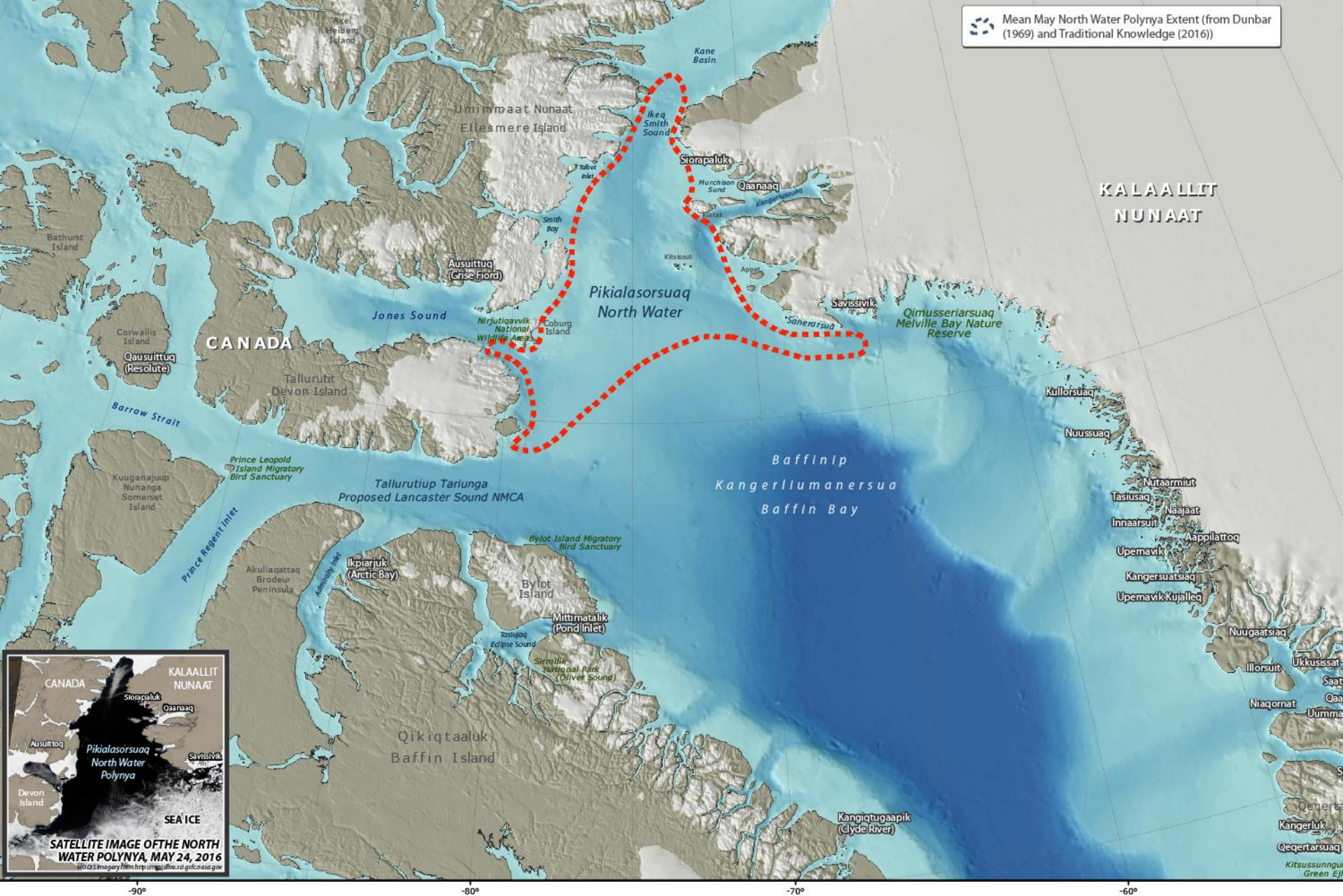
Map of Pikialasorsuaq between Nunavut, Canada and Greenland