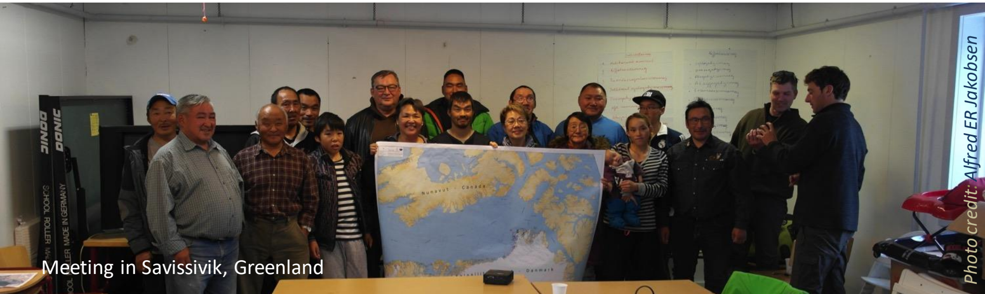
Meeting in Savissivik, Greenland