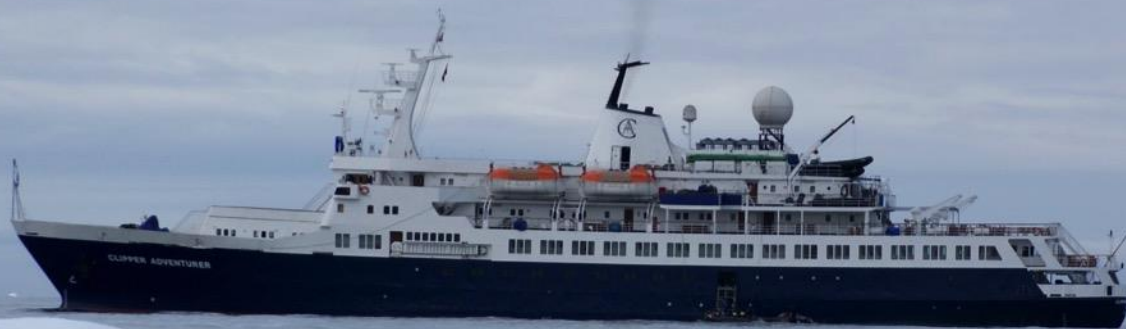
Clipper Adventurer tourist ship

–Marty Kulluguktuq, Ajuittuq (Grise Fiord)