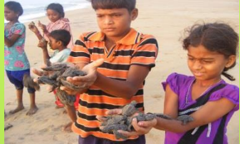
Why do communities conserve? Lessons from Samudram Women's Federation in Odisha, India