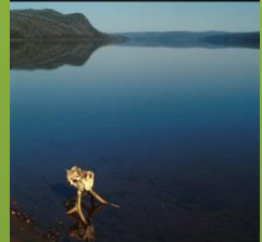
Developing a community-based Innu Nation environmental policy in Natuashish, Labrador, Canada