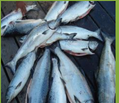
Aboriginal fishing rights, livelihoods, and resource conservation. Nuu-chah-nulth Tribal Council, Vancouver Island, Canada