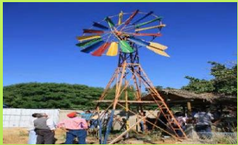
Mainstreaming climate change in the Coquimbo Region, Chile