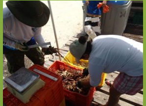
Strengthening the capacity for ecosystem change in coastal communities: the spiny lobster fishery of Punta Allen, Quintana Roo, Mexico