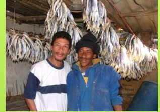
Recognising rights and integrating local knowledge into an estuary management plan in the Olifants Estuary: South Africa